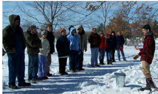
Maple Syrup Day Demonstration 2013