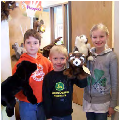
Maple Syrup Day 2013