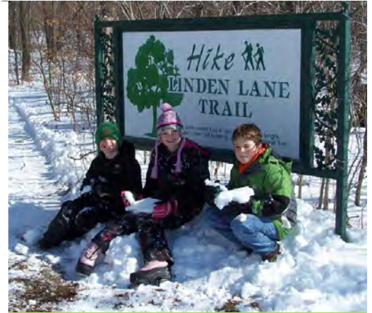
Maple Syrup Day 2013